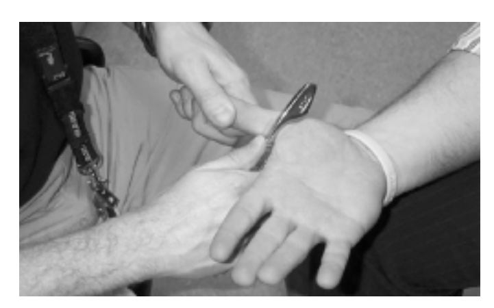
Figure 3 Graston Technique performed on 1st right metacarpophalangeal joint capsule volar surface.